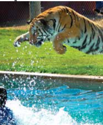
Out of Africa Wildlife Park