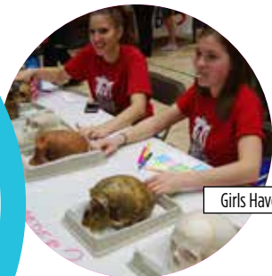
Girls Have IT Day