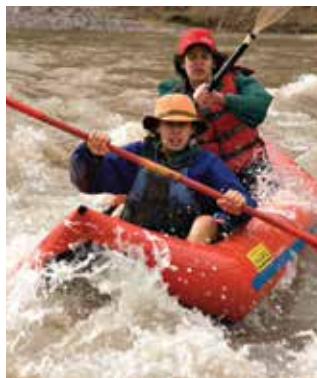
Gila River Rafting