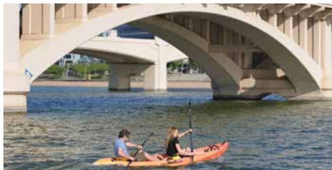
Tempe Town Lake

Flagstaff Community STEM Celebration (March 6) Add Flagstaff Festival of Science (late September)