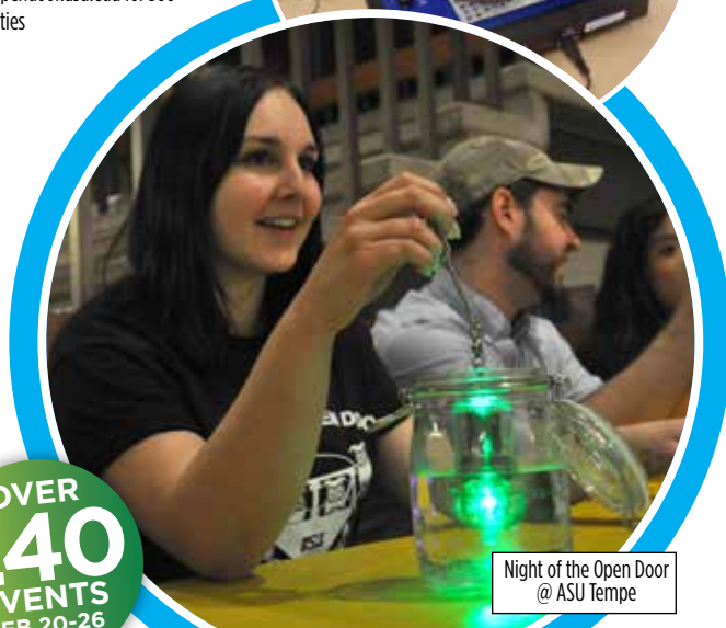
Night of the Open Door @ ASU Tempe