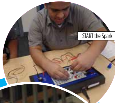
START the Spark

3:00PM – 9:00PM ASU Night of the Open Door @ Tempe University Dr & Mill Ave, Tempe See opendoor.asu.edu for 300+ activities