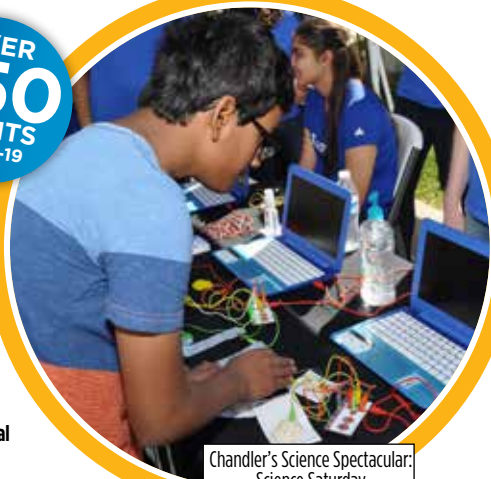
Chandler's Science Spectacular: Science Saturday