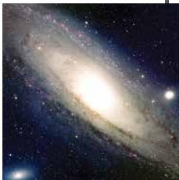
Kitt Peak National Observatory